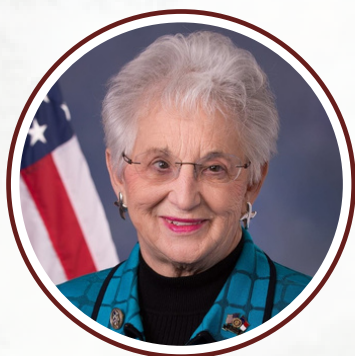
CHAIRWOMAN VIRGINIA FOXX