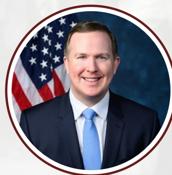
REP. BRIAN JACK