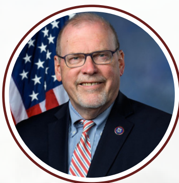
VICE CHAIR MORGAN GRIFFITH