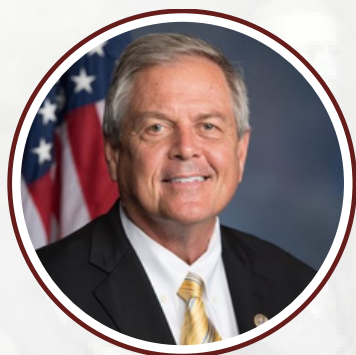
REP. RALPH NORMAN