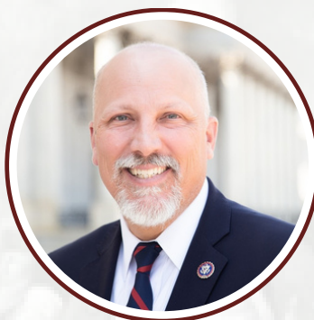
REP. CHIP ROY