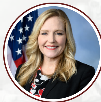
REP. ERIN HOUCHIN