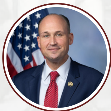
REP. NICK LANGWORTHY