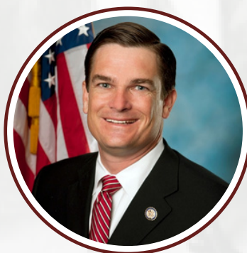
REP. AUSTIN SCOTT