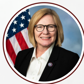
REP. MICHELLE FISCHBACH