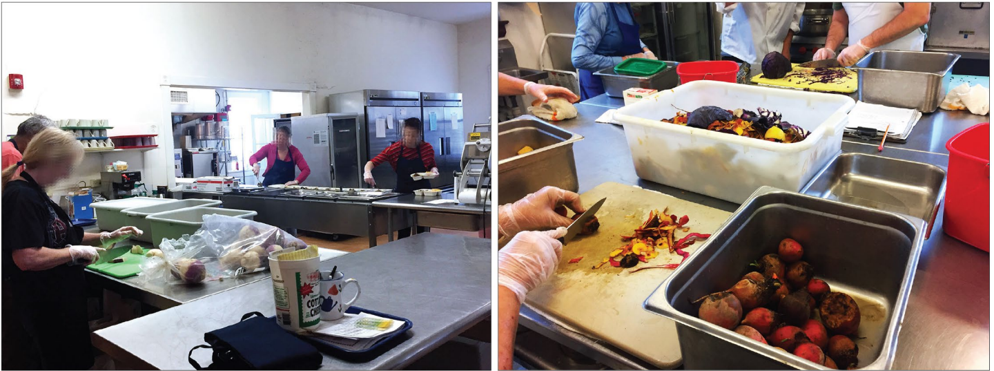
Figure 8: Volunteers Helping to Prepare Food for Nutrition Assistance Programs Serving Older Adults in Selected States