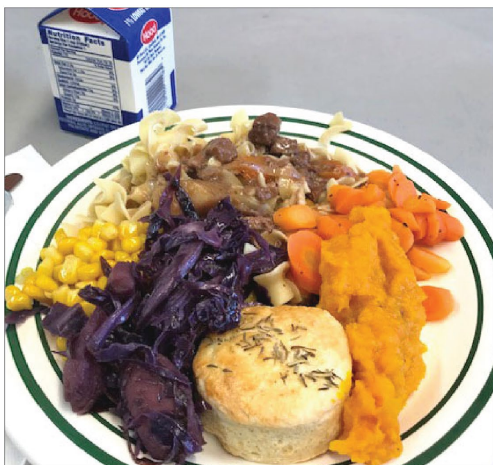
Congregate lunch of beef stew over egg noodles, carrots, corn with brown butter sauce, braised red cabbage with apples, mashed acorn squash, thyme buttermilk biscuit, and milk