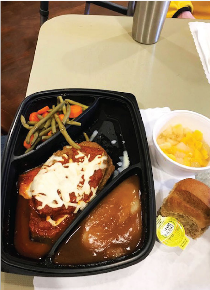
Lunch of meat loaf with red sauce, mashed potatoes and gravy, steamed string beans and carrots, fruit cup, and whole wheat bread roll with butter