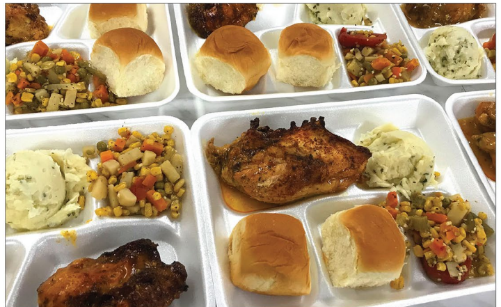
Lunch of roasted seasoned chicken on the bone, mashed potatoes, steamed vegetables, two white bread rolls