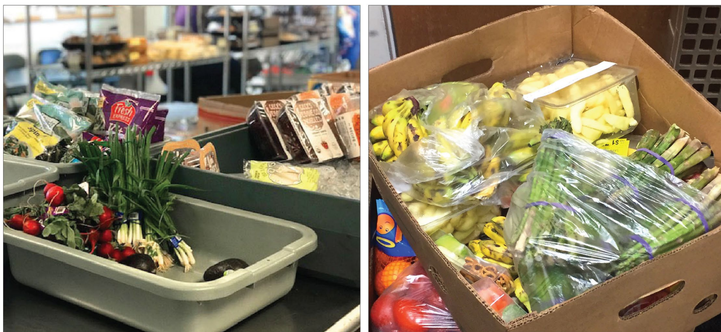
Figure 6: Examples of Food Donations at Congregate and Home-Delivered Meal Program Sites in Selected States

provided by local grocery stores and food banks and through a program in which local farmers dedicate some of their produce for donation. This provider indicated that food donations saved them $140,000 in food costs in 2018 (see fig.6).