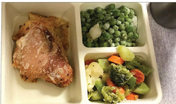
Home-delivered frozen meal of chicken, peas, and mixed vegetables