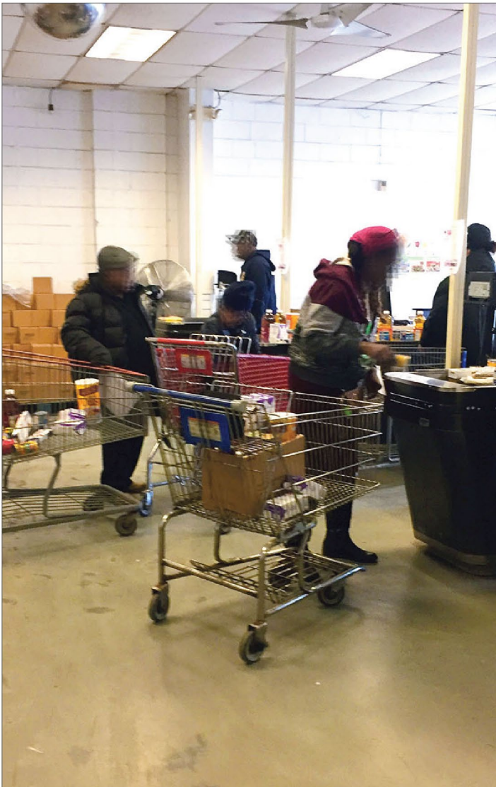
Figure 7: Example of a Grocery Store-style Shopping Model Used by a Commodity Supplemental Food Program Provider in One Selected State