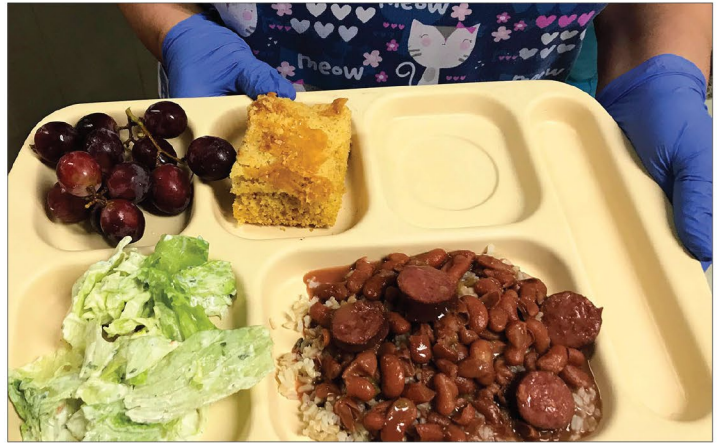
Lunch of red beans and sausage on brown rice, corn bread, salad and grapes