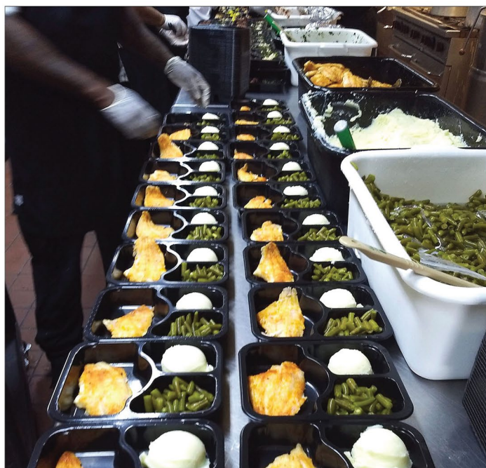
Home-delivered meal of fish, mashed potatoes, and green beans