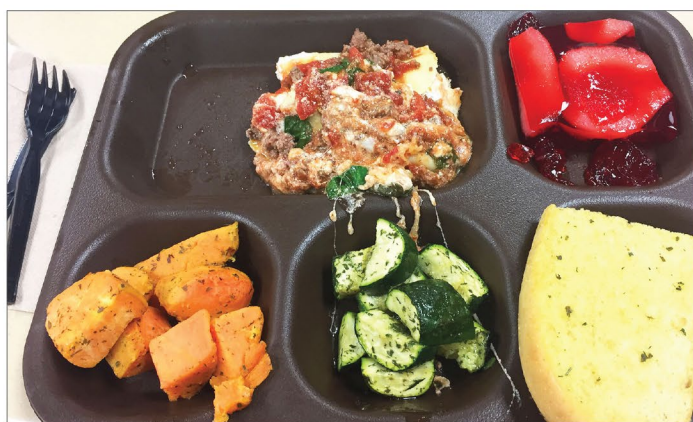
Congregate lunch of beef lasagna, roasted zucchini, sweet potatoes, garlic toast, and fruit gelatin